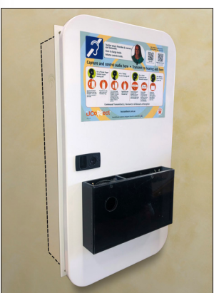
SoundHouse Recessed shown complete with flange. Square corners mean easy install. See hearandlearn.com.au/install