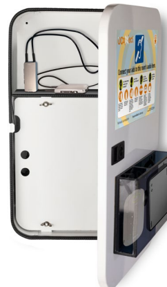
SoundHouse Interior View. Secure space for storing personal items and charging devices.

Depending on size and use of space, more than one SoundHouse may be required