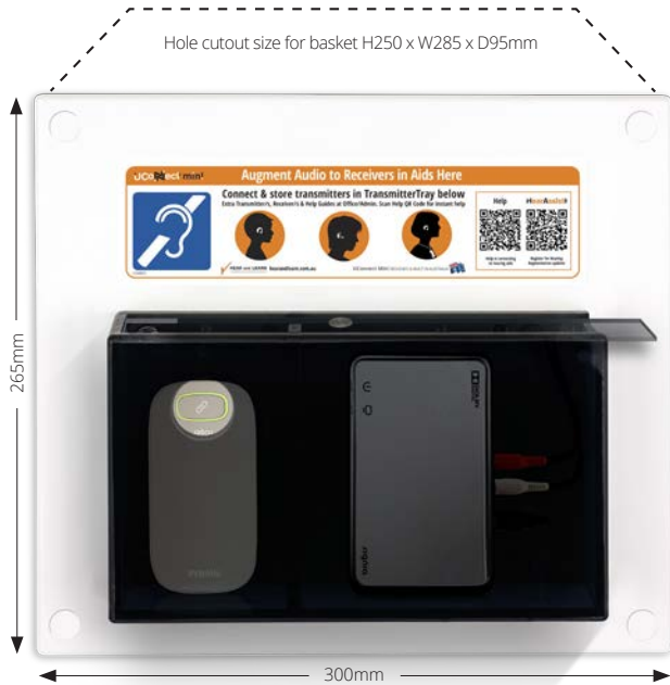
The UConnect Mini Wall Panel is mounted 1000mm from the bottom edge to the floor. It must be unobstructed and in line of sight to all learners in the learning space.

Expert Access Consultant Report on Compliance Readiness available on request.