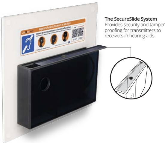
The SecureSlide System Provides security and tamper proofing for transmitters to receivers in hearing aids.