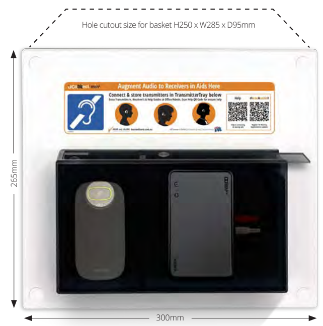
The UConnect Mini Wall Panel is mounted 1000mm from the bottom edge to the floor. It must be unobstructed and in line of sight to all learners in the learning space.

Expert Access Consultant Report on Compliance Readiness available on request.