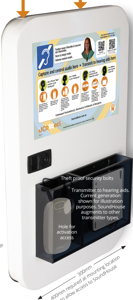
Theft proof security bolts

UConnect SoundHouse is mounted 1000mm from the bottom edge to the floor. It must be unobstructed and in line of sight to all learners in the learning space.