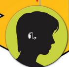
Augmentation to Signia receiver on hearing aid of secondary age learners (no phone, no tablet, no loop required)

Receivers in aids vary in brand & type. UConnect products are agile & agnostic.