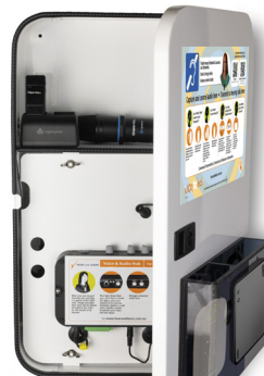
SoundHouse Interior View. Secure space for storing personal items and charging devices.

✓ Secure : UConnect SoundHouse LockBox means hearing aid transmitters are secure and accessible. The door is key locked guaranteeing chargers and microphones are safeproof.