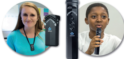
New Flexmike is 28% smaller & 33% lighter

Best of breed post-install commissioning, staff training and ongoing support to ensure industry best practice.