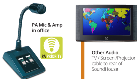
PA Mic & Amp in office

The Flexmike is a tiny H74 x W28 x D18mm and weighs only 34g. The Sharemike is a compact H153 x W28 x D28mm and weighs only 73g.