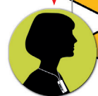
Augmentation via TSwitch using neck loop (mostly for teachers and visitors)