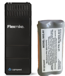
Flexmike (for use with Redcat Access)