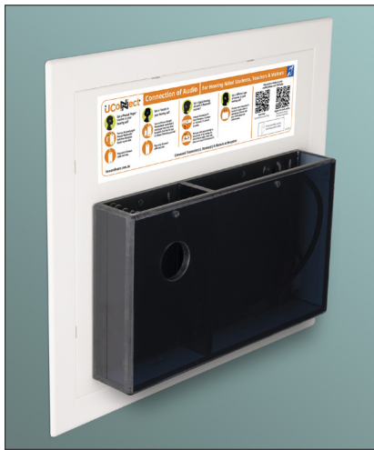
Finished look of UConnect Mini.